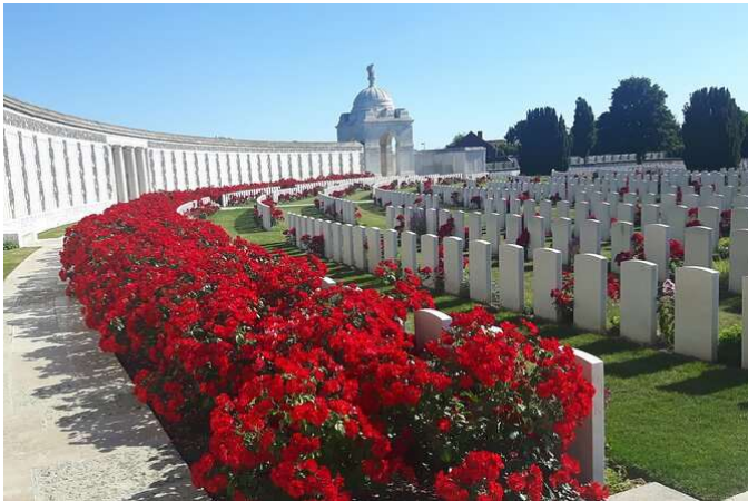
Flanders Field and Passchendaele Cemetery

The journey will likely include guided tours of Leuven, Brussels as well as another city in Belgium. Additionally, there will be a city visit of Ypres with a stop at the Passchendaele/Tyne Cot Cemetery as well as a possible visit to the Flanders Field Museum.