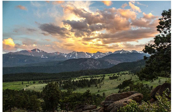
Rocky Mountains of Western Colorado

Volunteers for the Planning Committee as well as night, day and dinner hosts are still needed. Those interested should send an email to benoitp@ncf.ca .