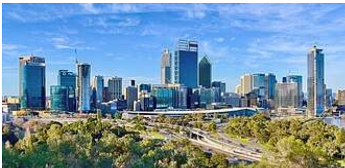
Skyline of Perth, capital city of Western Australia

12 members (including 4 new members) have currently signed up and planning has already started for the pre/post journey travel. Our best estimate is that the club and FFI fees will amount to about $575 CDN for the week. If you are interested in joining this journey, contact journeysffo@gmail.com . A second virtual planning meeting is scheduled in the next month.