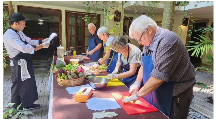
FFO members in Bali, Indonesia October 2023