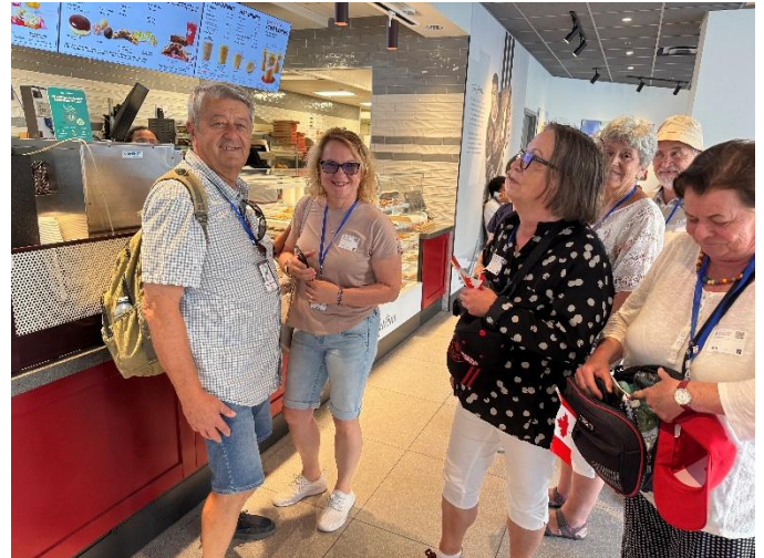
Showing FF Hungarians a Canadian tradition – at Tim's