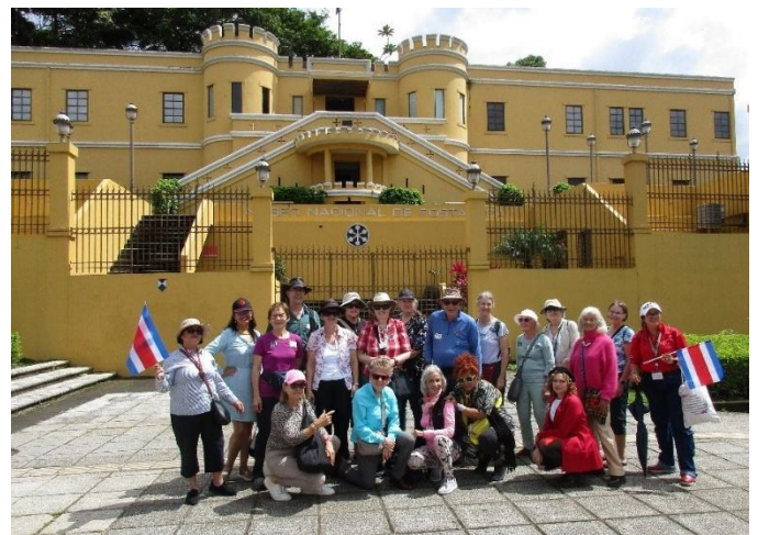
FFO members in Costa Rica, November 2024