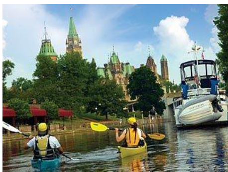
Canoes and boats on the Rideau Canal