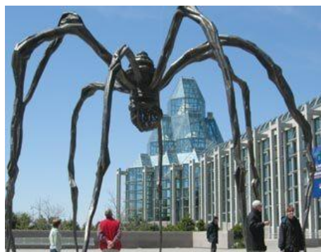
Canada's National Gallery and Maman