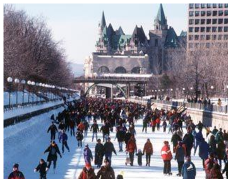
"The World's Largest Skating Rink"